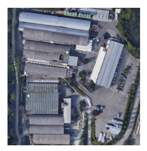
Figure 1: Tenax S.p.A production plant – Viganò (LC)

Name and location of the production site: Tenax S.p.A. - Via dell'industria 17 - 23897 Viganò (LC) - Italy