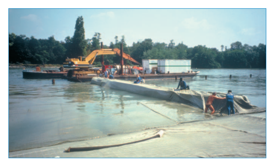
Captions: Placing a panel on the barge

In Autumn 1993 a considerable damp area was noticed on the outer slope of the embankment, which prompted the operator to carry out a further investigation. Bathymetric measurements of the canal profile indicated that the clay layer had severely eroded at several points, the concrete slabs were worn