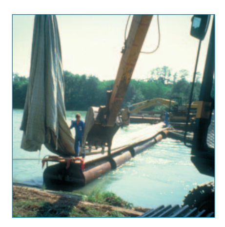
Placing a panel on the barge for installation

From the various renovation proposals Incomat <sup>®</sup> Standard, the geosynthetic sealing system, was chosen. The Incomat <sup>®</sup> concrete mattress offered several advantages. It provided under-water execution, rapid installation and uncomplicated