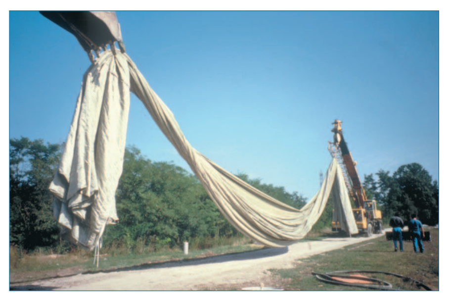
Bringing a panel onto site