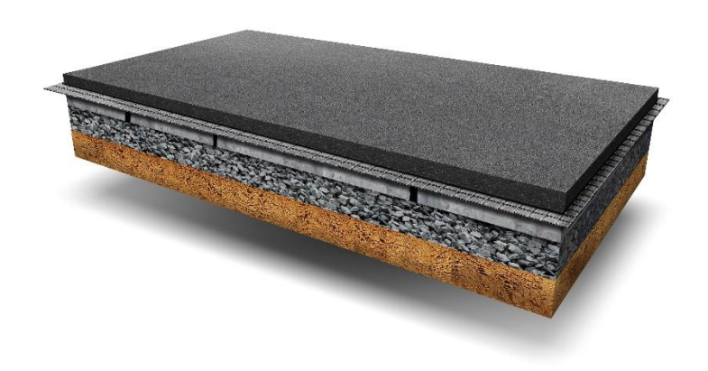
Figure 1: Asphalt pavement with HaTelit® (second top layer)