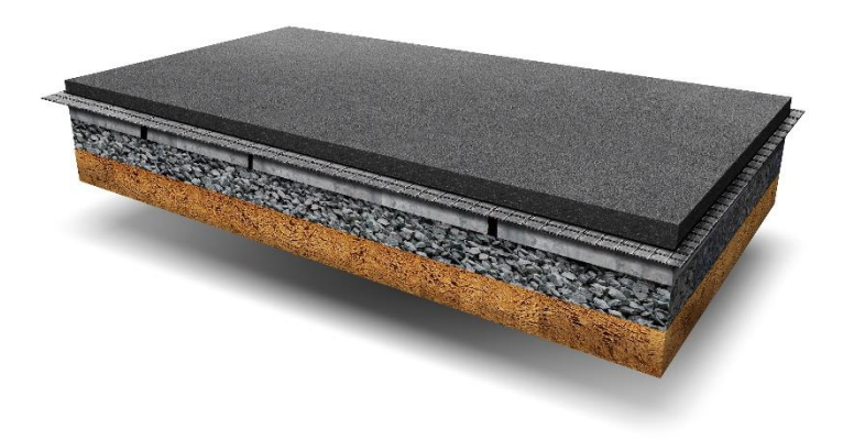
Figure 1: Asphalt pavement with HaTelit<sup>®</sup> (second top layer)